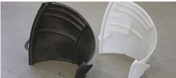
3D printed parts for Planetary Resources' Arkyd spacecraft. At left is a titanium part created by the QuickCast method on a 3D Systems SLA printer. At right is a plastic part manufactured directly by a ProJet 7000 SLA machine.