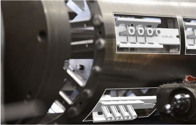
3D-printed forming pistons installed on an Idaho Steel Nex-Gem Former machine.

From the beginning, it was understood that Idaho Steel would make no compromises in quality for the sake of speed.