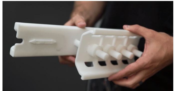
The redesigned forming piston printed by 3D Systems ProX 500 printer is faster to manufacture, more durable, and safer for food processing.

“SLS 3D printing enables us to design for superior strength and durability,” says Jon Christensen, marketing and sales manager at Idaho Steel. “For those new to it, the idea of ‘printing’ parts may not convey the fact that when finished, these parts are solid plastic. Parts can also be designed for added strength in ways that are not possible through traditional machining.”