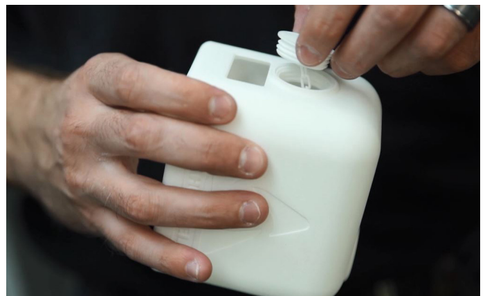
Idaho Steel used the 3D Systems ProX 500 to redesign a housing for easier access to the laser sensor inside.

Idaho Steel began printing the part on the ProX 500, yielding major improvements. The opening at the top was made larger for easier access to the sensor, corners were rounded, and the housing was made as a single part with a plastic chain connecting the screw-top cap to the housing so it will not be misplaced when the sensor is being accessed.